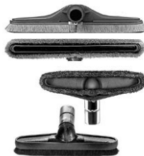
Smooth Surface Tools