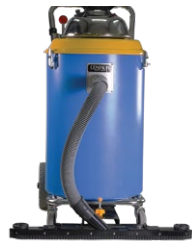
26" Front Mount Squeegee