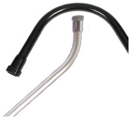
Wands (Various Shapes & Lengths)